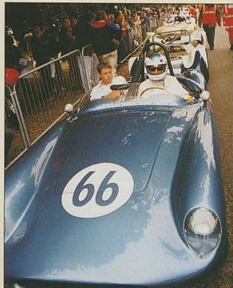
The Echidna-Chevrolet heads up Class 7, European and American Sports Car racers from '1950 to '665, as they prepare to take to the hill.

G oodwood Festival of Speed has been a well kept secret in the hot rodding fraternity for a few years now, with many recognisable faces in the crowd should you have paid a visit. The appearance of drag cars in 2002 brought the event to the attention of many who had never attended, and with the inclusion of a hot rod display and Fuel Altereds on the track, this year's Festival was positively overrun with rodders!