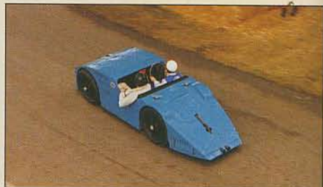
Built in '39, this Bugatti Type 32 'tank' is the only survivor of a number of similar streamlined racers, entered by the French national motor museum.

How will they top it all next year? We've no idea, but the Festival gets better each time, so we're sure they'll find a way. Meantime, for those with a circuit racing fetish, or who like to see Lotus Cortinas and the like battling it out round corners, there's still the Revival Meeting at Goodwood circuit on September 3-5. A unique homage to old style racing, everything within the circuit is as it was prior to 1966 and visitors are encouraged to wear period attire. See www.goodwood.co.uk for ticket details or call 01243 755055.